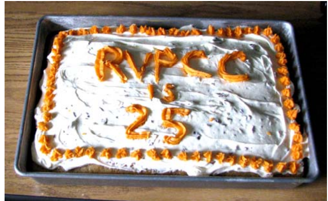
RVPCC celebrated its 25th anniversary in October.