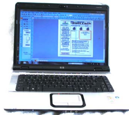
Modern laptop Weight <7#