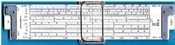
Slide rule—do you still have one?