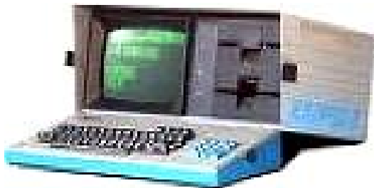
Kaypro 'luggable' computer— about 1983 Weight about 35#