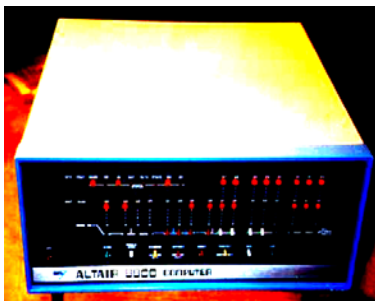
MITS's Altair 8080—you enter each CPU code separately using switches on front panel